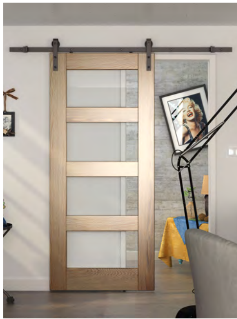
89 Series | Bronze