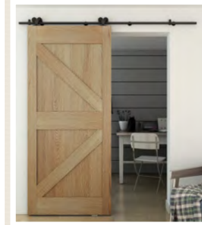
91-470 | Black