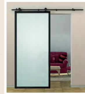
94-460 | Black Series with black aluminum framed door