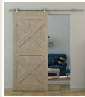
91-460 | SST