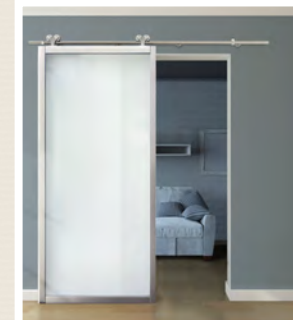
94-470 | SST Series with satin aluminum framed door