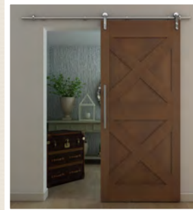
91-4100 | SST